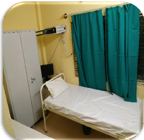
Doctor's Room Dressing Room