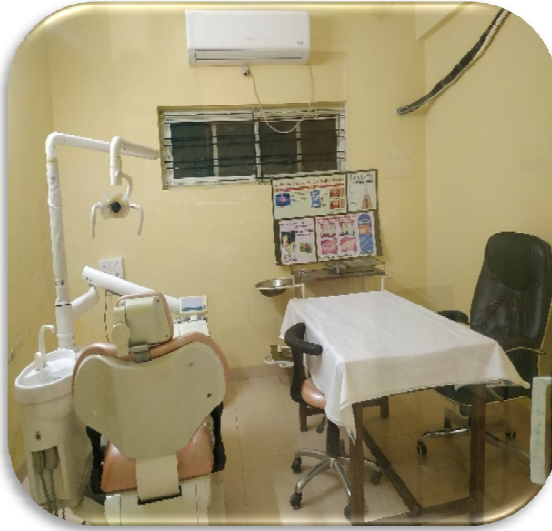
Dental Surgeon's Room