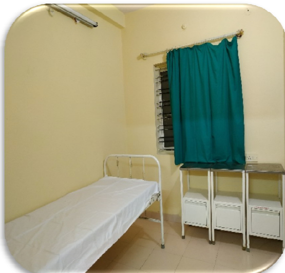
Recovery Room-1 Recovery Room-2