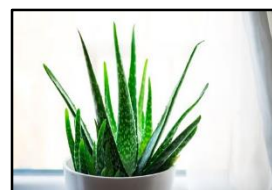
Aloe vera Plant