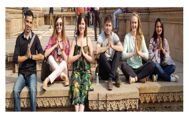
Foreign students at Gujarat Technological University during Winter School Program